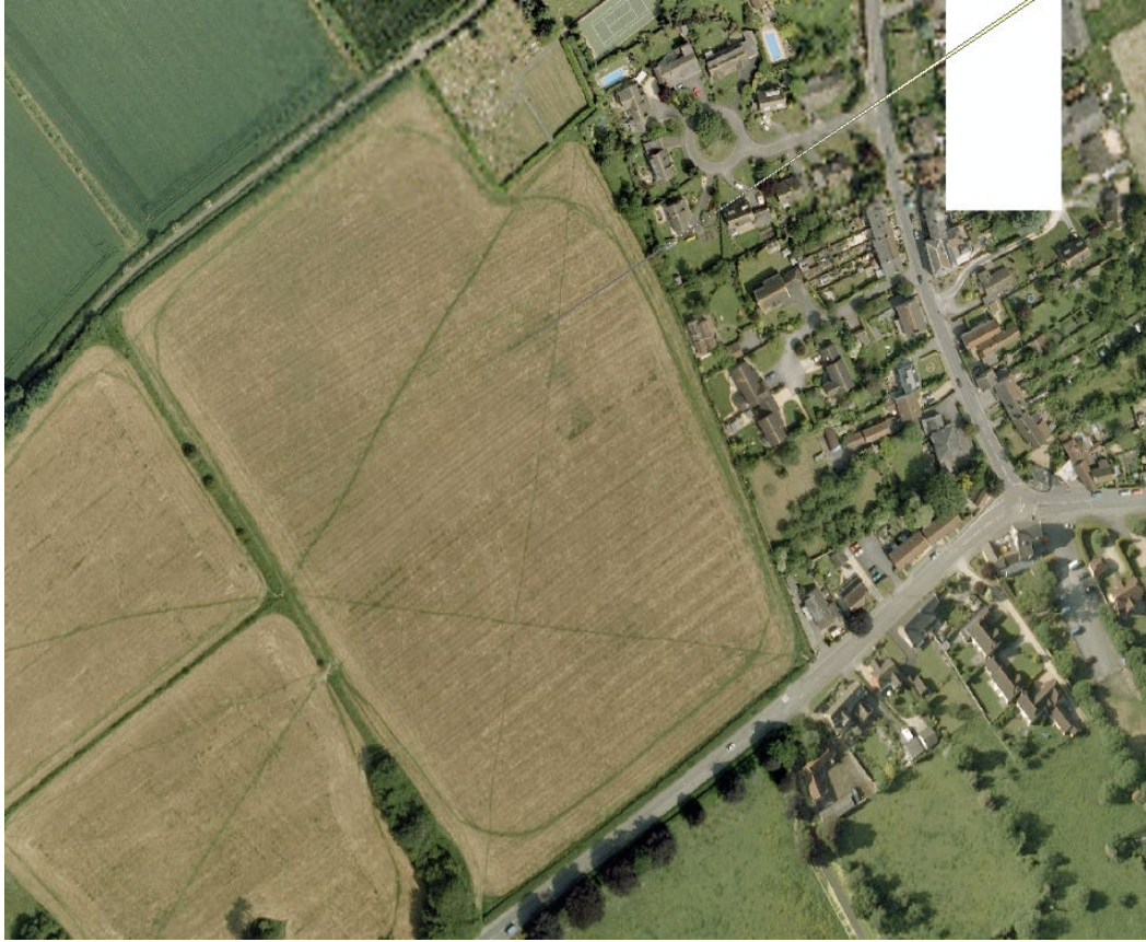
2006 aerial view of land